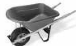
(6 cu.ft.) Pivot point nose for easy dumping

The wheelbarrow no home should be without. Featuring Brentwood's unique tiered, built-in shelf tray with pockets.