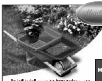
The built-in shelf tray makes home gardening easy

GroundsKeeper's unique design and ease-of-use is the ultimate value