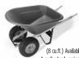
(8 cu.ft.) Available in 1 or 2 wheel versions